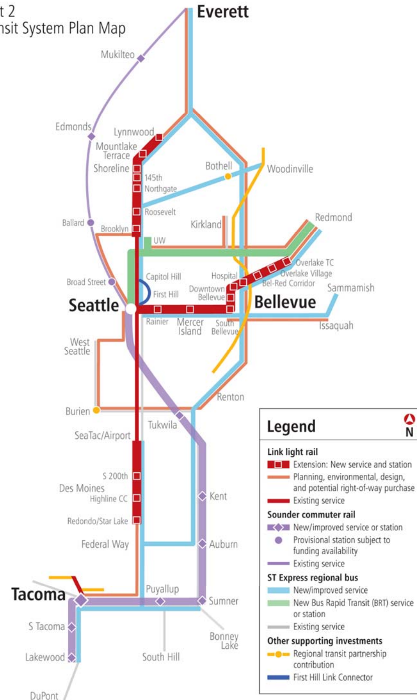
Sound Transit 2 Regional Transit System Plan Map